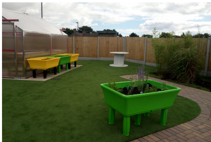
Brightly coloured Green and Yellow planters in the sensory garden at the Maria Goretti Foundation

The Maria Goretti Foundation in Ireland has taken delivery of 8 garden4me planters. The facility provides a holistic service, supporting both child and family, in a home from home environment for children, with Autism, intellectual disability or physical and sensory disabilities.